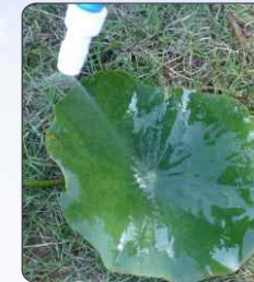
With Surfact-V (Surfact-V @ 35 ml / 100 L water)