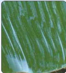
With Surfact-V (Surfact-V @ 25 ml / 100 L water)