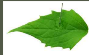
Water + Ultrawet = Spreading, Penetration and Absorption