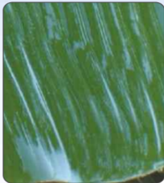
With Surfact-V (Surfact-V @ 25 ml / 100 L water)