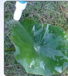
With Surfact-V (Surfact-V @ 35 ml / 100 L water)