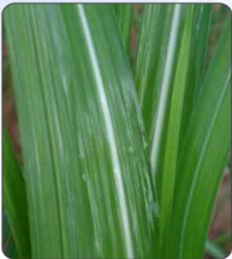
With Surfact-V (Surfact-V @ 25 ml / 100 L water)